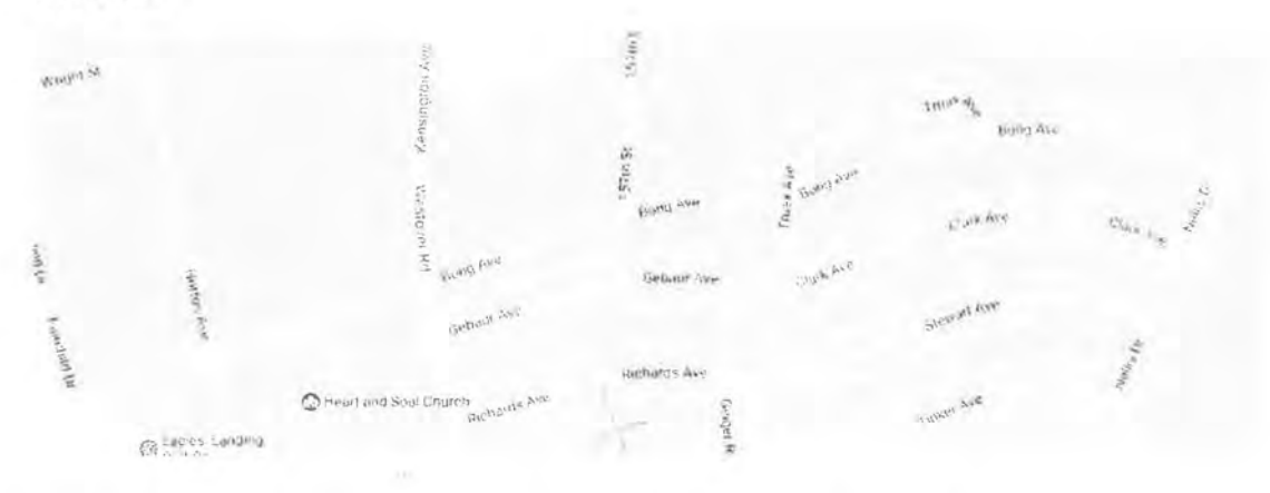
Proposed: (Circled area only is the proposed section for renaming)