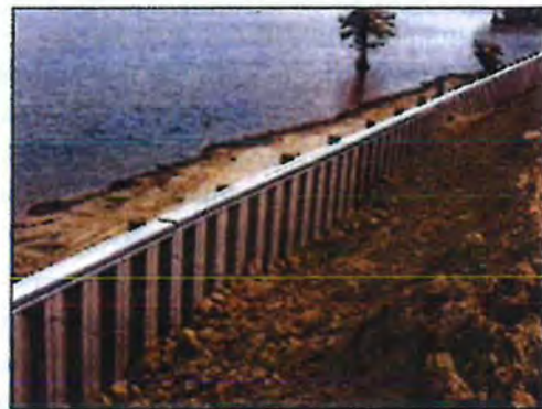
Pictured above: examples of sheet pile walls.